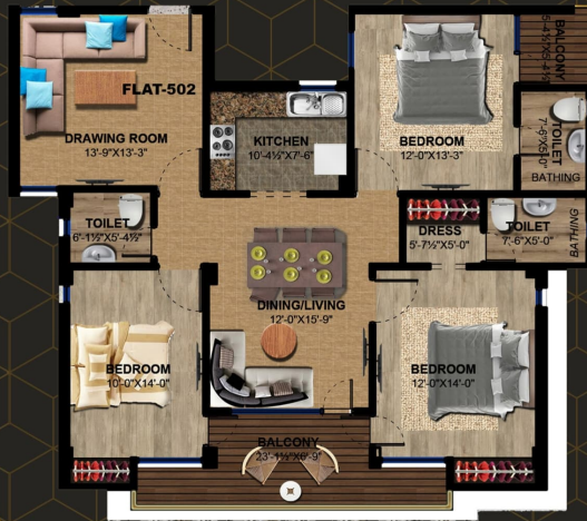
FLAT - 502

CARPET AREA .....1257.24 sq.ft. BUILT UP AREA .....1400.30 sq.ft. SUPER AREA .....1750.38 sq.ft.