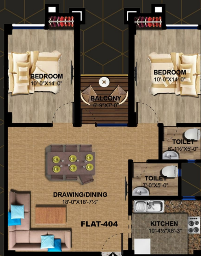
FLAT - 404

CARPET AREA .....876.21sq.ft. BUILT UP AREA .....980.16 sq.ft. SUPER AREA .....1225.20 sq.ft.