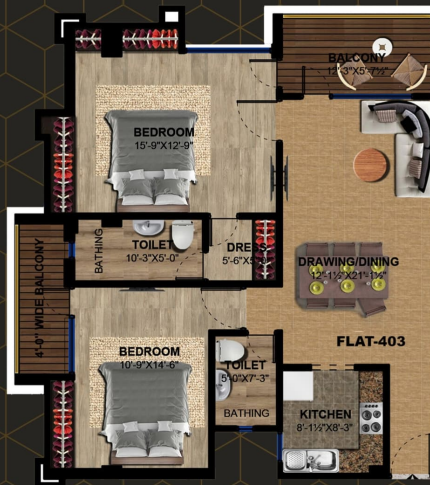
FLAT - 403

CARPET AREA .....1024.42 sq.ft. BUILT UP AREA .....1127.17 sq.ft. SUPER AREA .....1408.96 sq.ft.