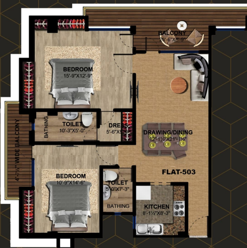
FLAT - 503

CARPET AREA .....1071.83 sq.ft. BUILT UP AREA .....1174.12 sq.ft. SUPER AREA .....1467.65 sq.ft.