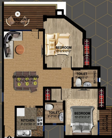
FLAT - 105

CARPET AREA.....917.83 sq.ft. BUILD UP AREA.....1013.54 sq.ft. SUPEER AREA.....1266.93 sq.ft.