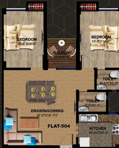
FLAT - 504

CARPET AREA .....876.21 sq.ft. BUILT UP AREA .....969.78 sq.ft. SUPER AREA .....1212.23 sq.ft.