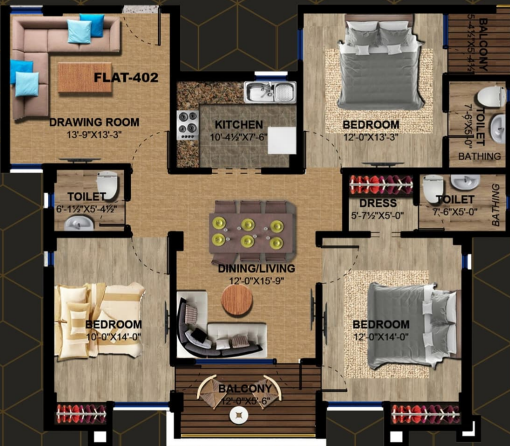
FLAT - 402

CARPET AREA .....1216.42 sq.ft. BUILT UP AREA .....1364.88 sq.ft. SUPER AREA .....1706.10 sq.ft.